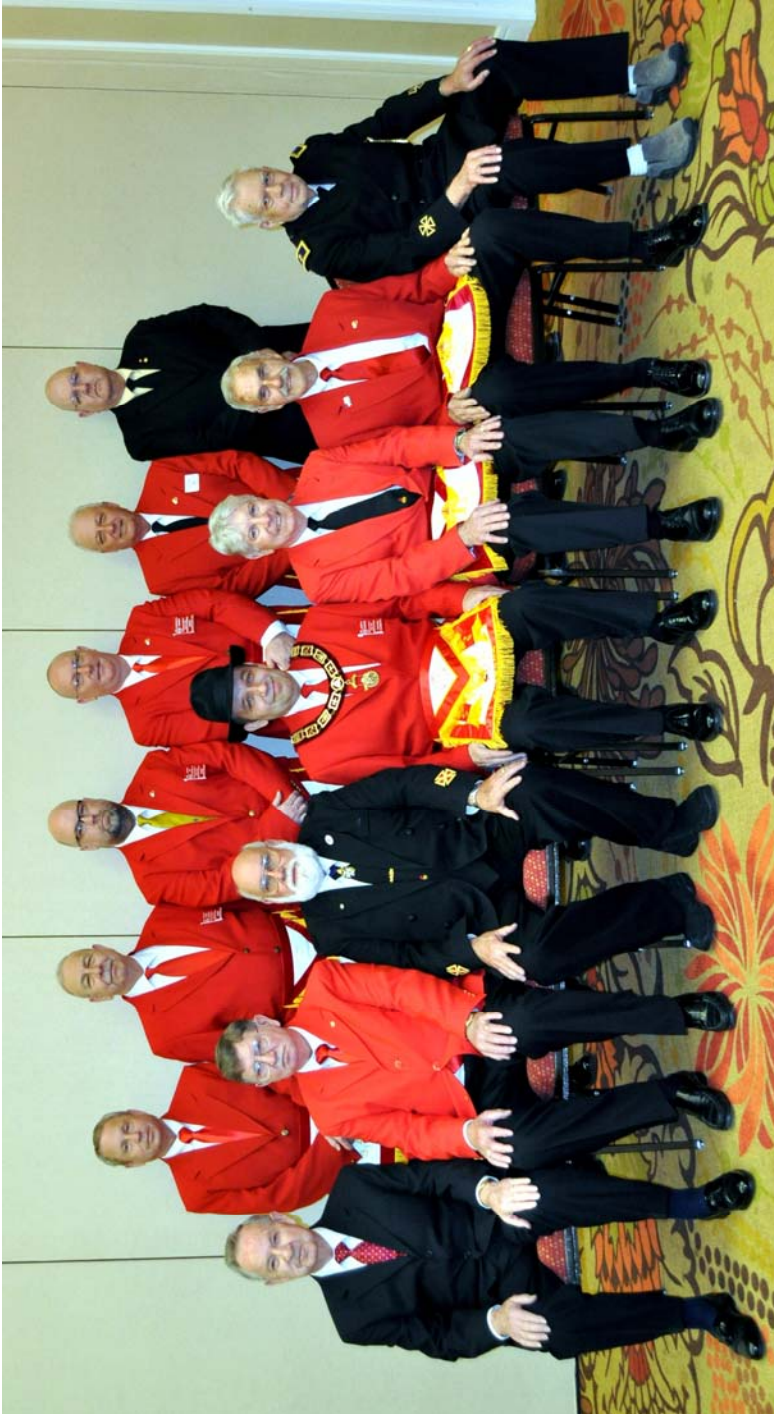
See Legend on Next Page for Names of Officers in Picture