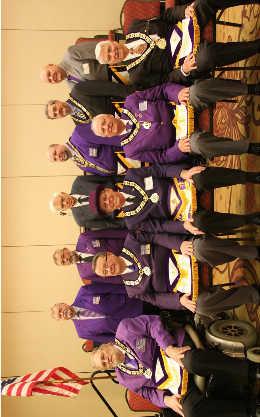
See Next Page for Legend of Members in Picture